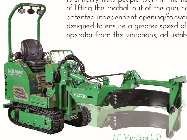
14" Vertical Lift

The HZC 30 is a treedigger which includes a series of innovations, the result of a search for solutions to simplify how people work in the nursery. To the standard equipment make parts: vertical system of lifting the rootball out of the ground, displacement of the blade/vibrator of 35° on both sides, patented independent opening/forwarding tracks system with centralized greaser, hydraulic system designed to ensure a greater speed of movement of approach to the tree, insulation system for the operator from the vibrations, adjustable holder arm for mounting blades.